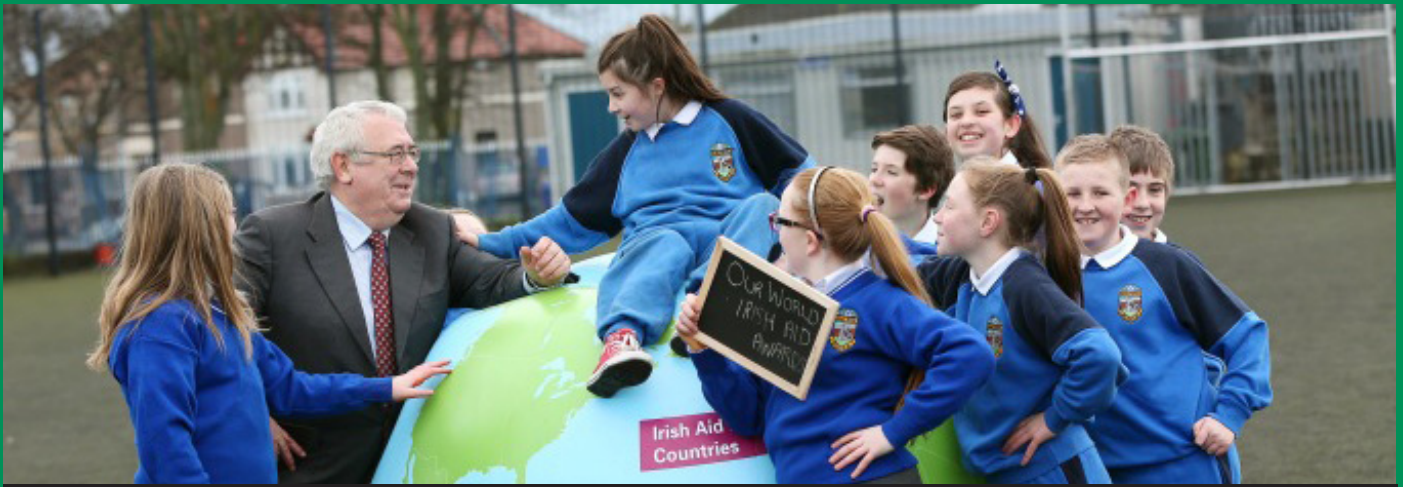
Minister of State for Trade and Development, Mr Joe Costello T.D., launches the 2014 Our World Irish Aid Awards at Scoil Bhara Primary School in Innishmore, County Cork.

Government of Ireland Rialtas na hÉireann