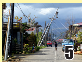
How Irish Aid responds to emergencies