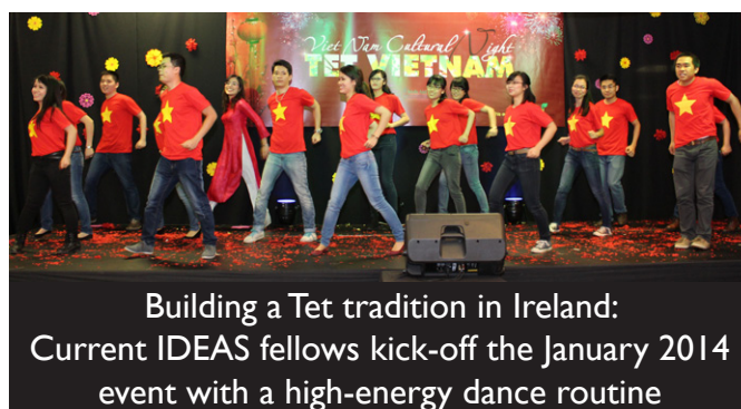
Building a Tet tradition in Ireland: Current IDEAS fellows kick-off the January 2014 event with a high-energy dance routine